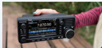
One hand holdable package

“Base station radio” performance and functions are packaged in a compact size of approximately 20 cm, 7.9 in (W) × 8 cm, 3.1in (H) × 8.5 cm, 3.3 in (D). The weight is approximately 1 kg (excluding battery pack and antenna). Its compact and lightweight design enables you to hold it with one hand.