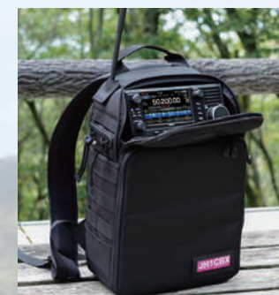
LC-192 Multi-function backpack

The IC-705 fits perfectly in the optional dedicated LC-192 multi-function backpack. It has various functions, such as holes for the antenna and holes for passing through coaxial cable and microphone cable. You can easily operate the IC-705 with it in the backpack.