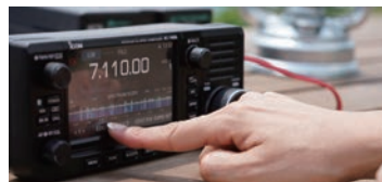
Touch screen display

The large 4.3 inch touch screen color display is the same size as the one used in the IC-7300 and IC-9700. It dramatically improves visibility and operability in the fields.